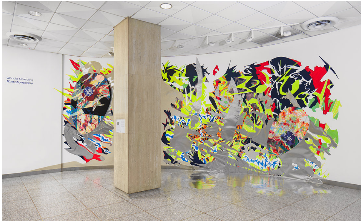
Radiationscape , 2018, aluminum, egg tempera and oil on wall, floor and canvas, 360cm x 1000cm x 250cm, Art in Buildings 55 5th Ave Space, New York City, USA.