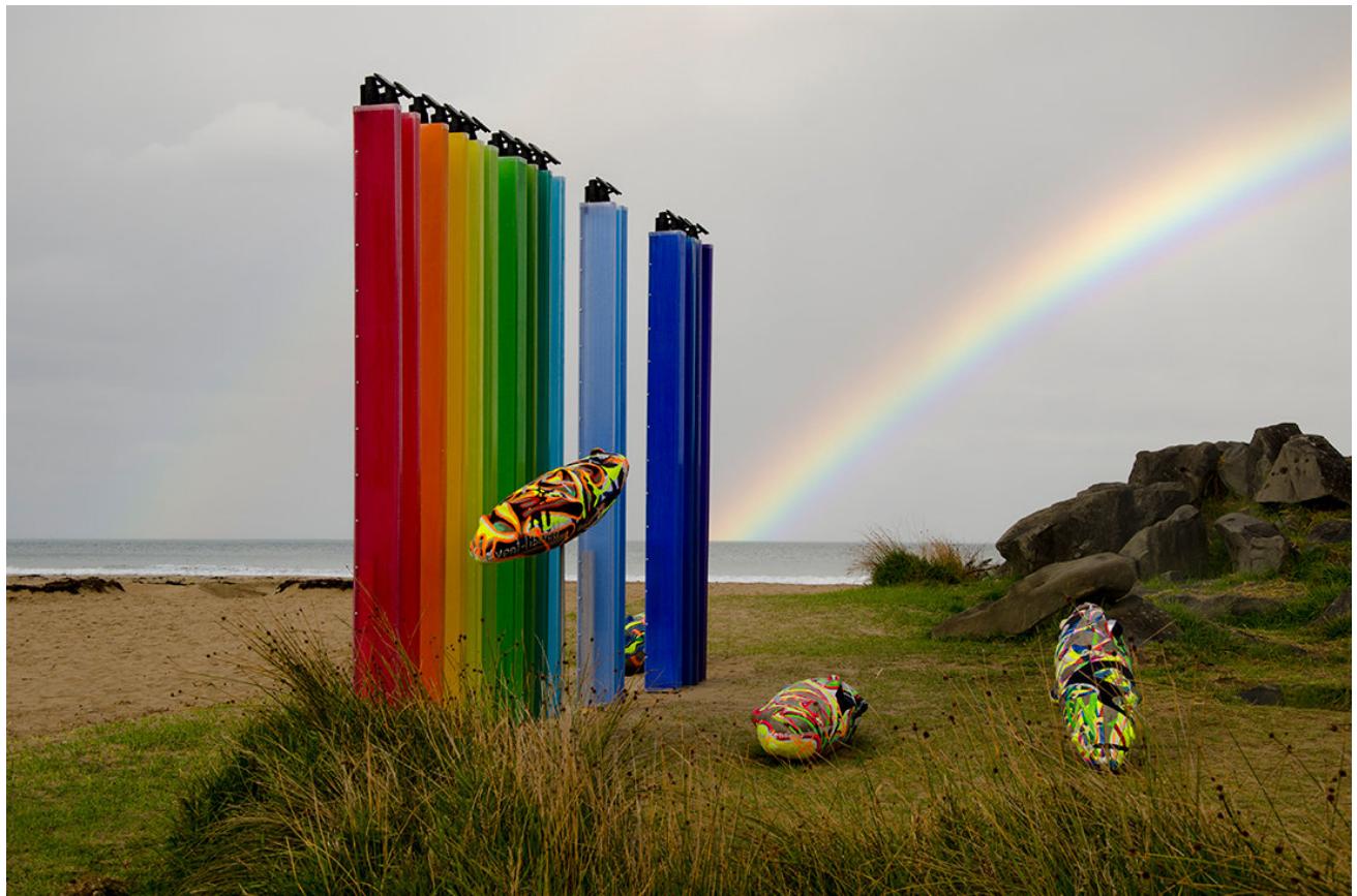
Coding the Earth , (Barcode: Sky*Stars Capsules: Albert 1, Albert 2: monkeys sent into outer space in 1949, Gladys and Esmeralda: spiders sent into outer space in 2011) in collaboration with artist Milovan Destil Markovic, 2018, polycarbonate, pigment, MDM binder, aluminum leaf, concrete, wood and solar lights, 300 cm x 500 cm x 300 cm, Lorne Biennale, Victoria, Australia.