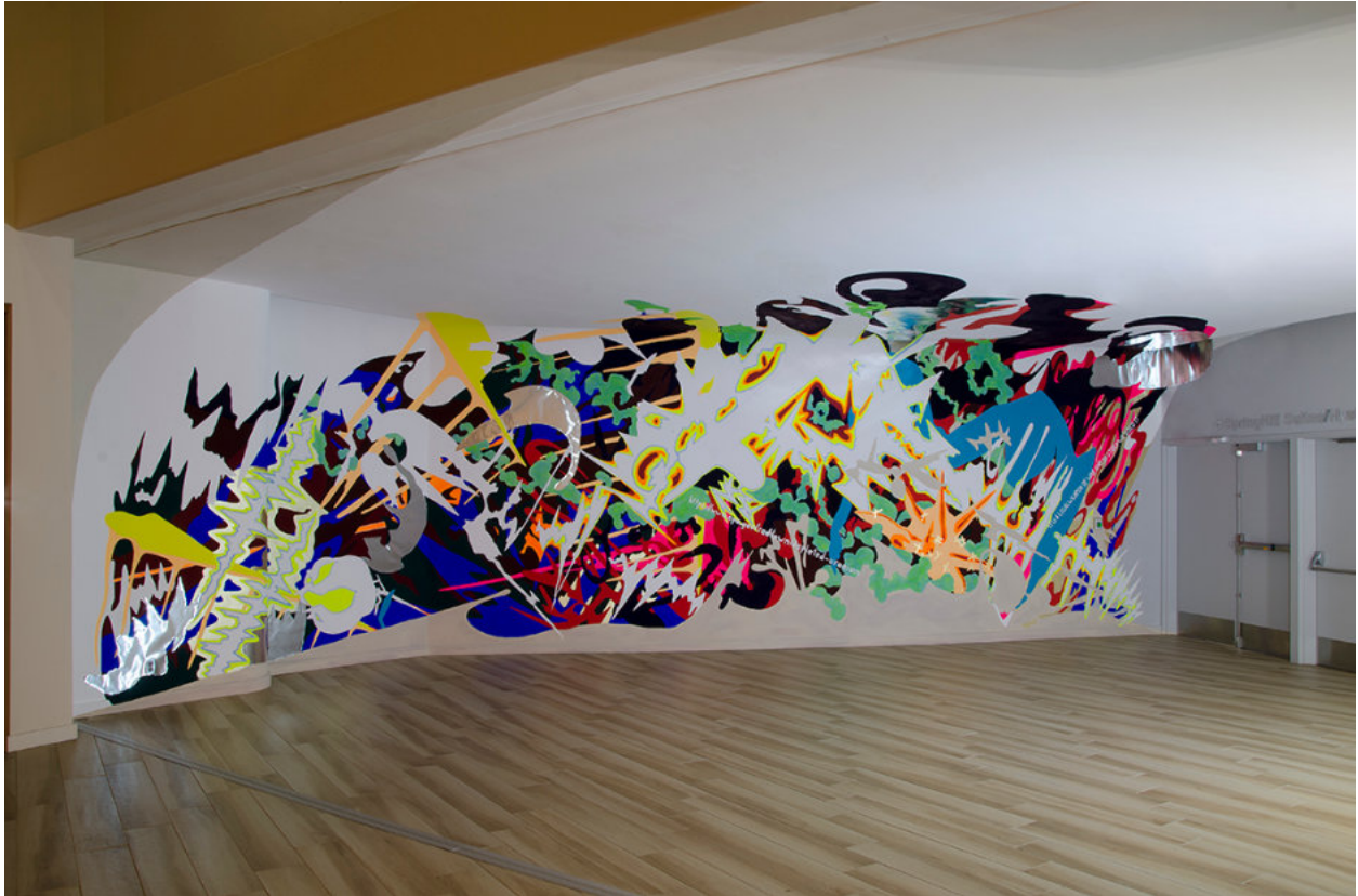
mutopia 2 , 2019, gold leaf, aluminum, egg tempera, MDM and oil on wall and ceiling, 330cm x 1100cm x 3300cm, Art in Buildings 310W., Milwaukee, USA.