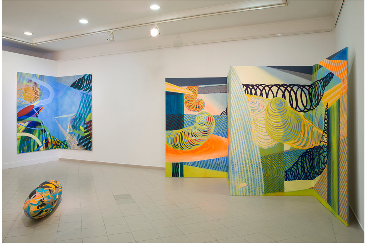
room scapes of solo exhibition mutopia 3 , 2019, Art Gallery Nadezda Petrovic, Cacak, Serbia.