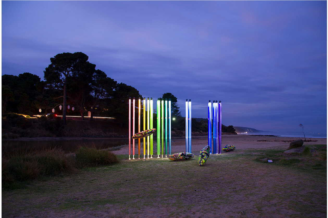
Coding the Earth at twilight, 2018.