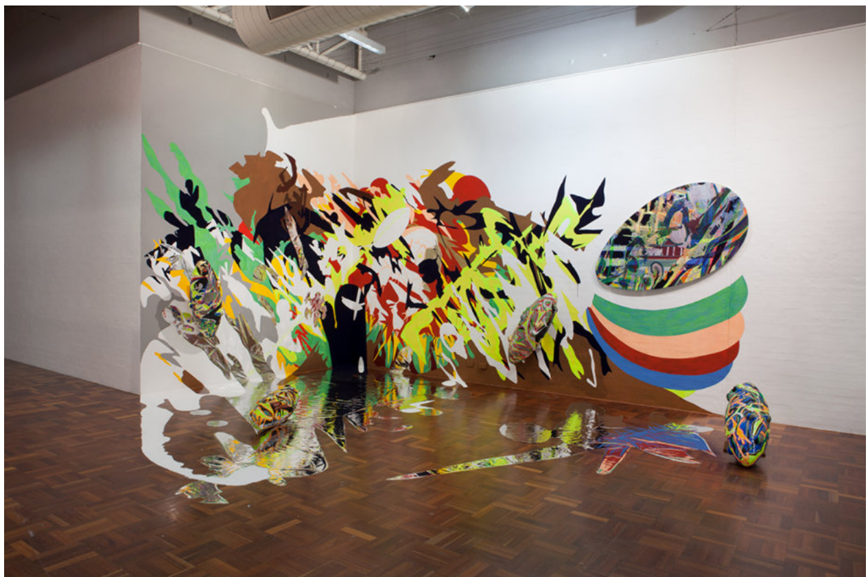
mutopia 1 , 2019, gold leaf, PVC silver, pigments, MDM and oil on wall, floor, canvas and concrete, 600cm x 900cm x 600cm, SOAD Gallery, Canberra, Australia.

Very helpful is the Berlin government who greatly supports artists and free-lancers. Artists determine this city and we are a respected entity. At the beginning of the pandemic crisis, the Berlin government offered support for artists and freelancers. Immediately the "bbk berlin" (Berufsverband bildender Künstler*innen Berlin e.V.) send out info and offered advice. The "bbk berlin" was also a driving force in installing the support for artists and freelancers. Looking around the globe this is pretty unique and I am grateful to the Berlin government and the "bbk berlin" for their engagement and support. This support is for every free-lancer living in Berlin no matter what nationality. If you don't have your papers in order yet, because for example you just moved, you are invited to contact the "bbk berlin" and they will assist.