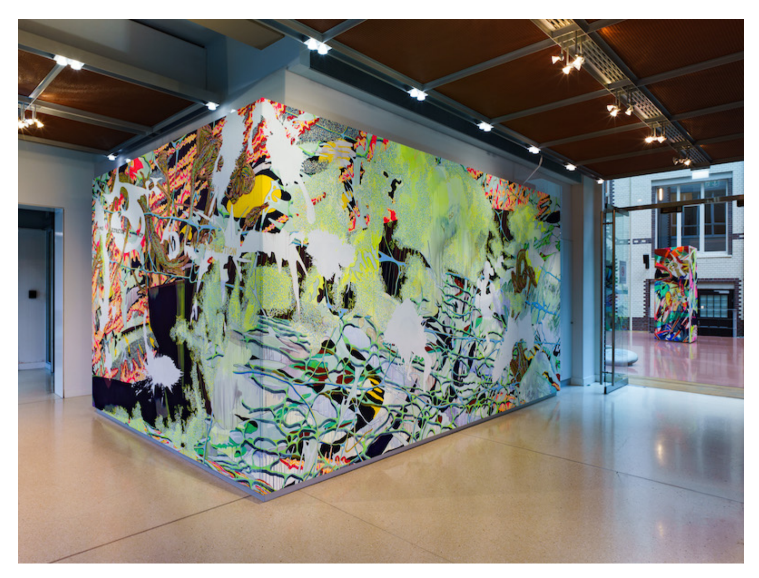
Claudia Chaseling: Mutopia 5, 2020, gold leaf, pigments, MDM and oil on canvas, 290×910 cm

Claudia Chaseling is a German-Australian artist and currently living and working in Berlin and Canberra. Chaseling's 'mutopia 5' is an explosion of colour spreading over the floors and walls of the building. The sleek, modern look of this official building is disrupted by bright, neon patterns and splashes of white negative space covering the walls. The colours are almost painful, a strange impression that is reminiscent of that which is man-made and that which is dangerous, venomous, like the skin of those small, deadly frogs in tropical forests.